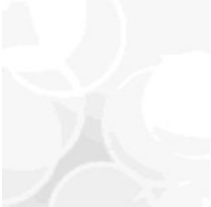
Design Review- 4700 Brooklyn Ave NE